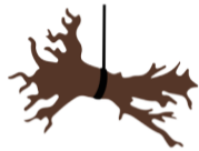
Removal of instream snags