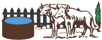
9 offshore stock watering points installed